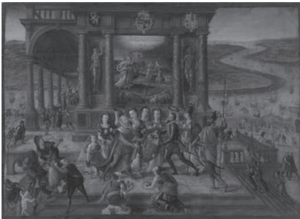
Fig. 2: Hans Vredeman de Vries, Allegory on the reconciliation of Antwerp, after 1585. Museum Vleeshuis, Antwerp, AV 2009.009.01